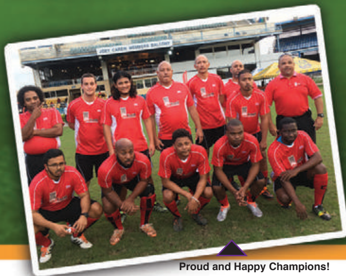
Proud and Happy Champions!