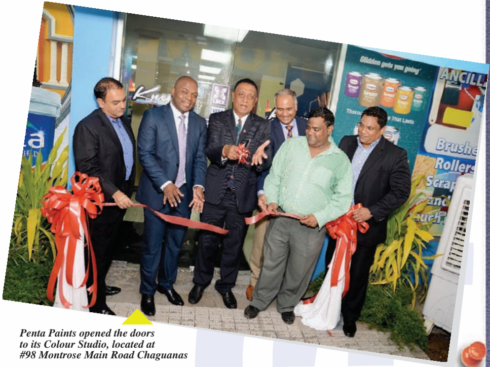
Penta Paints opened the doors to its Colour Studio, located at #98 Montrose Main Road Chaguanas