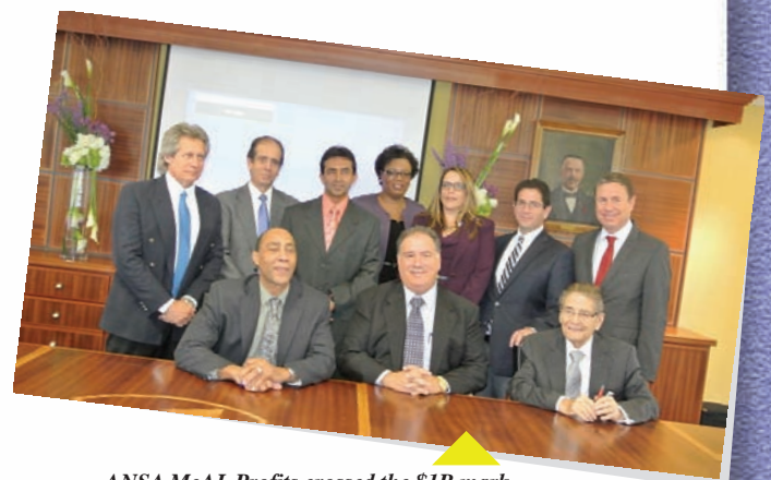
ANSA McAL Profits crossed the $1B mark