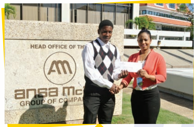
500 students from several communities got the opportunity to participate in an Exhibition and Cultural programme hosted by the Maitagual Unified Community Development