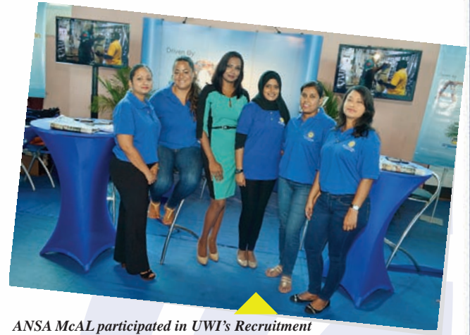
ANSA McAL participated in UWI's Recruitment Fair in Barbados, Cave Hills Campus and in Trinidad and Tobago, St Augustine