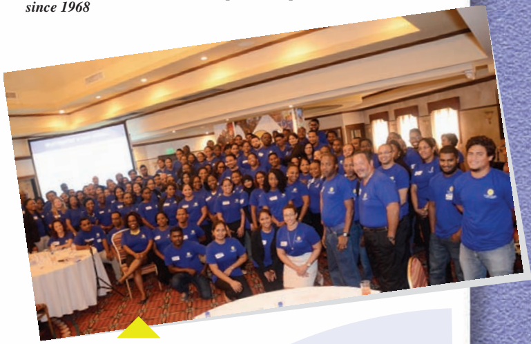
The ANSA McAL Group of Companies welcomed over 170 new employees at its HR #8 Orientation