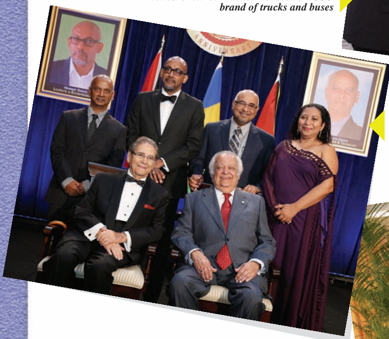
The Anthony N. Sabga Caribbean Awards for Excellence celebrated the induction of four new laureates and the culmination of a decade