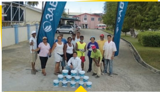
ANSA Coatings Ltd. contributed 12 gallons of Sissons Paints to the local organization Three Angles Broadcasting Network (3ABN) to refurbish the Princess Elizabeth Centre in Woodbrook Port of Spain