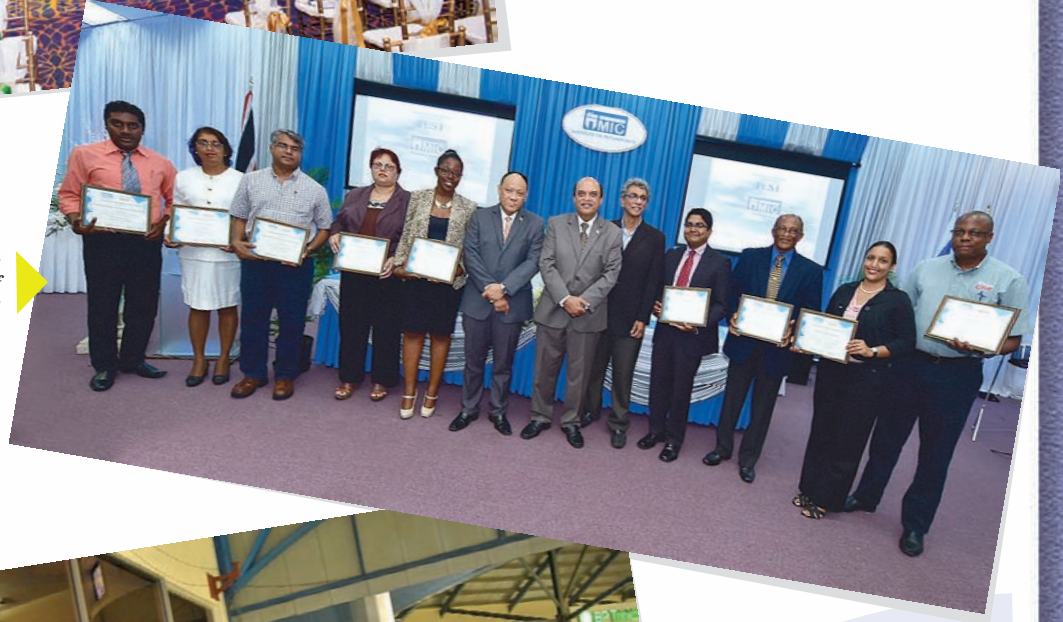
Carib Brewery employees graduated in the field of Mechatronics