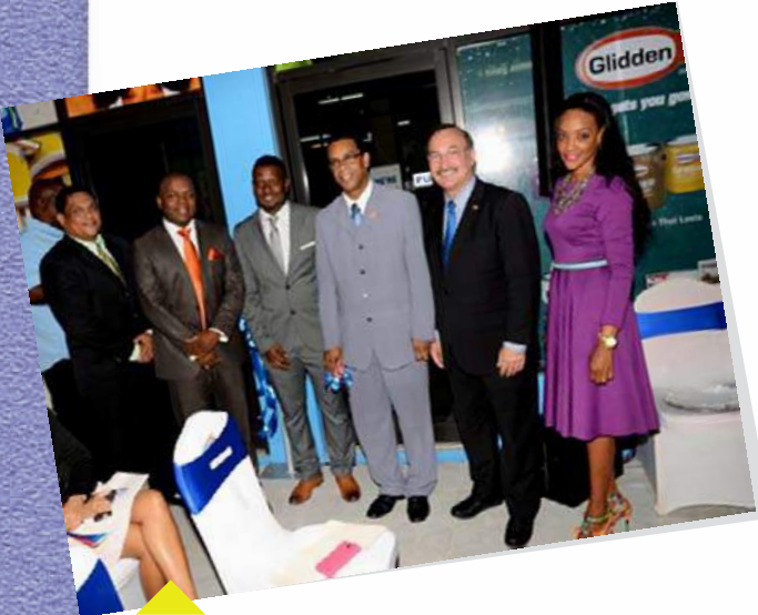
Penta Paints celebrated the opening of its Arima Colour Studio