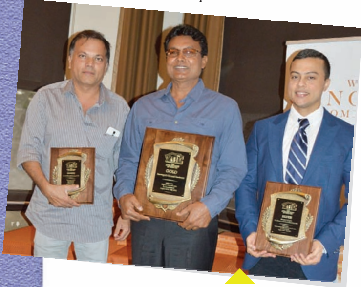
ABS hosted "Who is the Strongest of Them All" Awards and Appreciation Luncheon. The campaign was marketed to approximately two hundred and thirty six (236) hardware dealers throughout Trinidad and Tobago during the period August 2014 through to July 2015