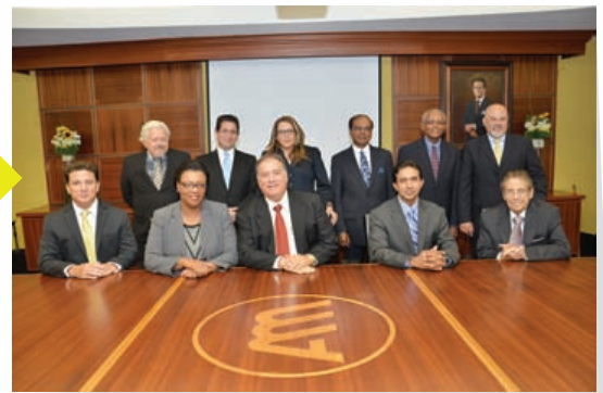
The Group crossed $6 billion in revenue as disclosed at the company's AGM