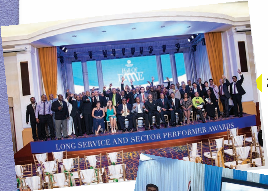
Employees of the ANSA McAL Group were honoured at the Long Service and Sector Performer Awards ceremony