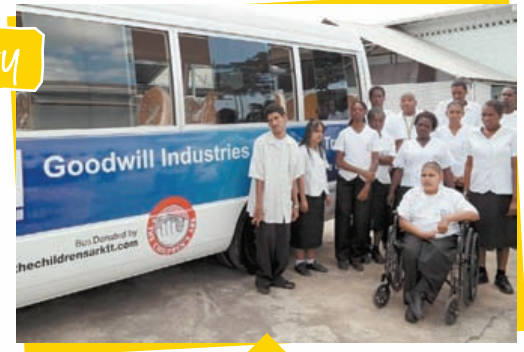
The Children's Ark foundation thanked ANSA Automotive for their support and assistance in purchasing a new 30-seater Rosa Mitsubishi bus. ANSA Automotive alongside the Ministry of Finance, the Comptroller of Customs and the Government of Trinidad and Tobago assisted with the $500,000 purchase that was handed over to local NGO, Goodwill Industries