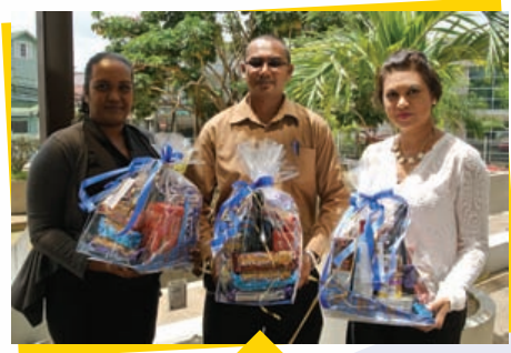
ANSA McAL was pleased to assist with a contribution of hamper prizes to the Youth Training Centre of Trinidad and Tobago