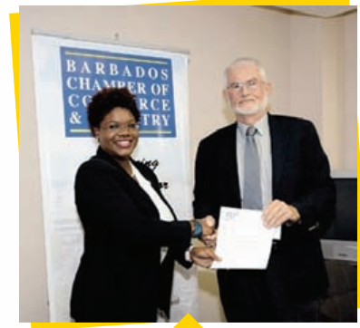
Brydens Insurance (Barbados) pledged its support to a creative campaign that was launched in Barbados for the third consecutive year. The 'Walk the Talk' Programme encourages persons to get fit and take responsibility for their health by taking up the challenge of walking a minimum of 10,000 steps a day