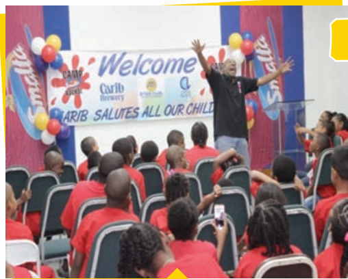
Employees accompanied by their children thoroughly enjoyed a day of fun at the Smalta Kids Camp held on the Brewery compound