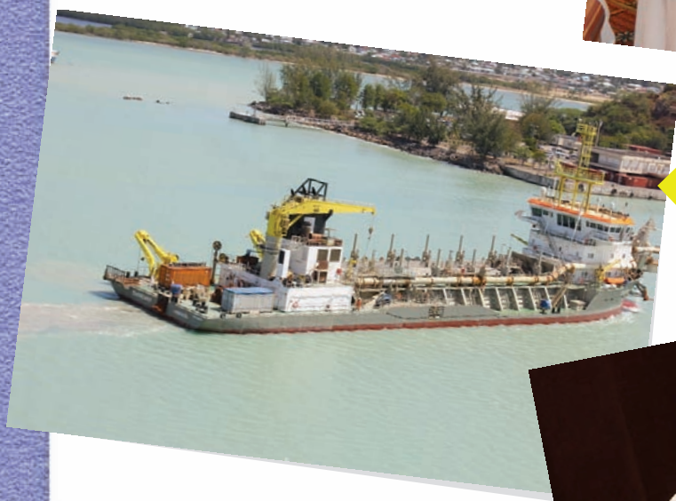
ANSA Technologies completed a TT$ 24 million dredging project for the Port of Antigua and Barbuda