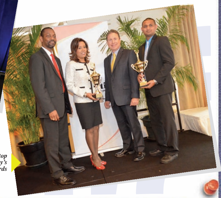
TATIL Life honoured its top performing agents at the company's Annual Sales Awards