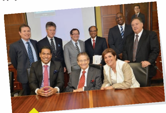
ANSA Merchant Bank achieved its second highest profit before tax of $262.2 million