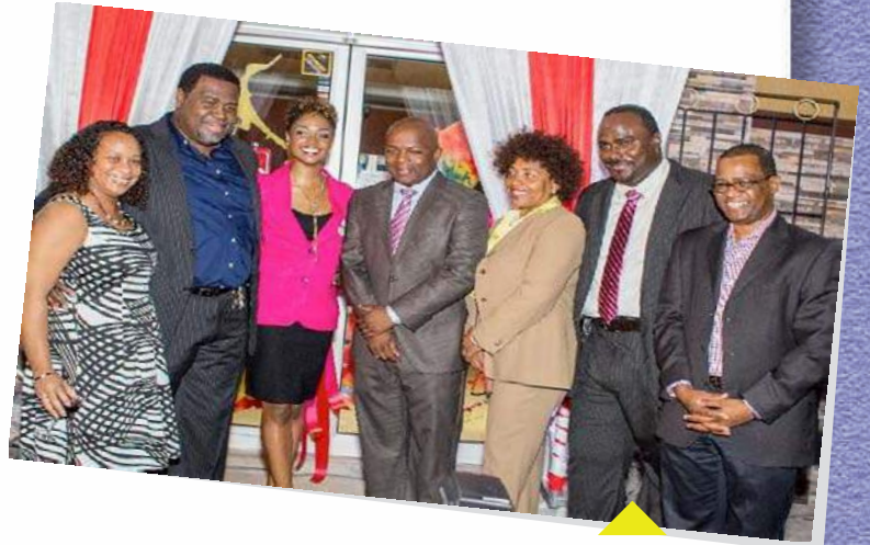
ANSA Coatings launched its new Sissons Colour Shop in Jamaica