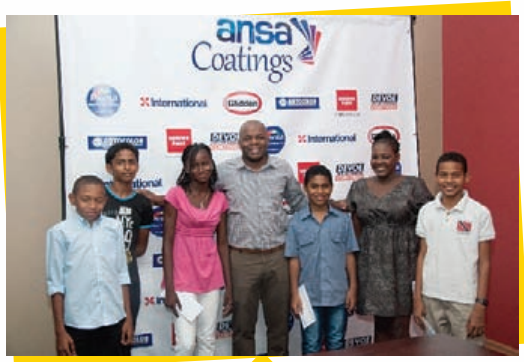
ANSA Coatings Limited awarded children of six employees with a grant in order to assist with the procurement of school books, uniforms and supplies for the September 2015 school term