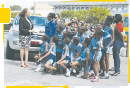
Preparations by the Luther Thorne Primary School for this year's National Primary Schools' Athletics Championships (NAPSAC) received a big boost of support from multi-brand automotive dealers McNearney Quality Inc. (Barbados)