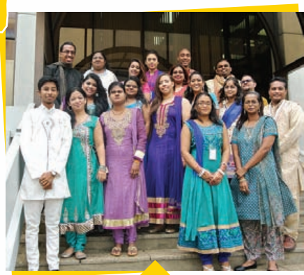
Celebrating the Festival of Lights