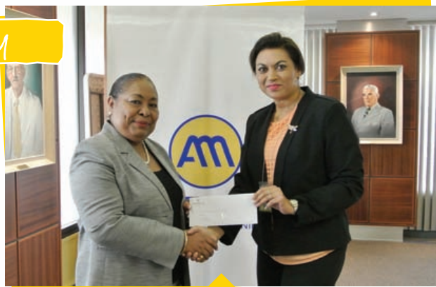
ANSA McAL sponsored the cost of a bursary for persons with disabilities offered by the National Centre for Persons with Disabilities