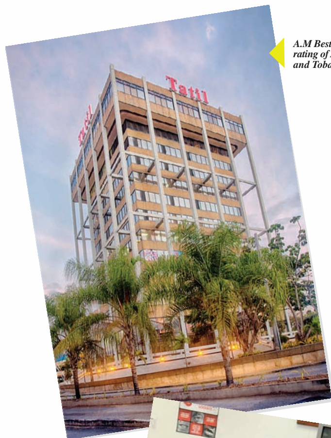
A.M Best, a global credit rating agency, affirmed the financial strength rating of A- (Excellent) and the issuer credit rating of "A" for Trinidad and Tobago Insurance Ltd (TATIL)