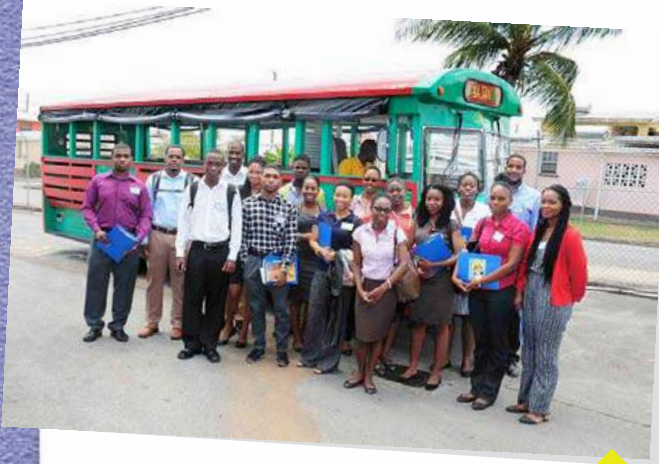
ANSA McAL (Barbados) Ltd launched its New Internship Programme