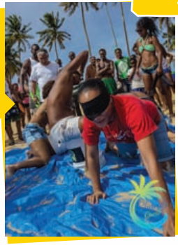
The Shandy Carib Team came out in their numbers and participated in the Shandy Carib Maracas Moments