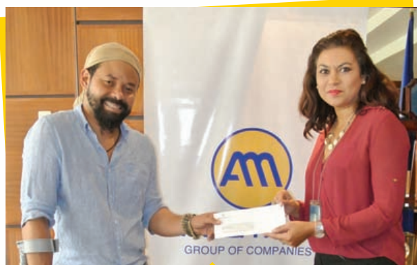
ANSA McAL supported Passion Fruit Publishing Ltd in their efforts to showcase the skills of Trinidad's top Costume and Design Artisans through a National Children's Storytelling Theatre Tour