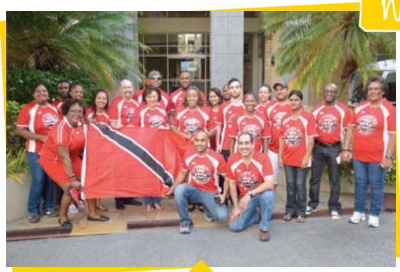
Football fever heightened in November as Trinidad and Tobago got an added boost from ANSA Merchant Bank supporters during the Concacaf World Cup qualifier against the United States at the Hasely Crawford Stadium, Port of Spain