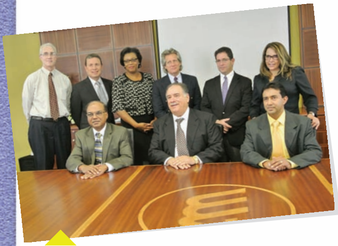
For the first six months of 2015, the ANSA McAL Group achieved revenue of $2.8 billion and $459 million profit before tax which resulted in an 11 percent improvement over the previous year