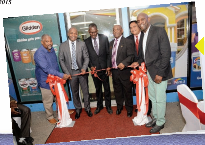
Penta Paints opened the doors to the Home Front Colour Studio located on Techier Main Road, Point Fortin