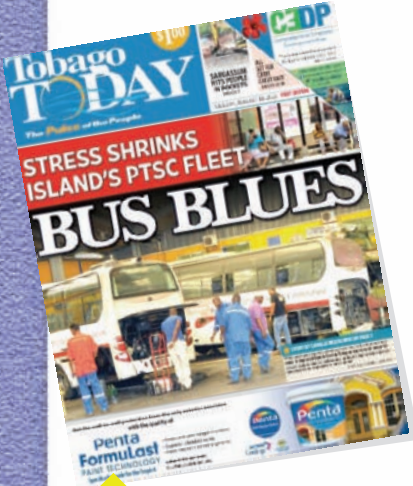
Project Merlin revealed "Tobago Today", a product of Guardian Media Limited