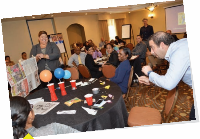
Companies from across the Group were challenged to discover new market opportunities in the Slingshot Workshop Series