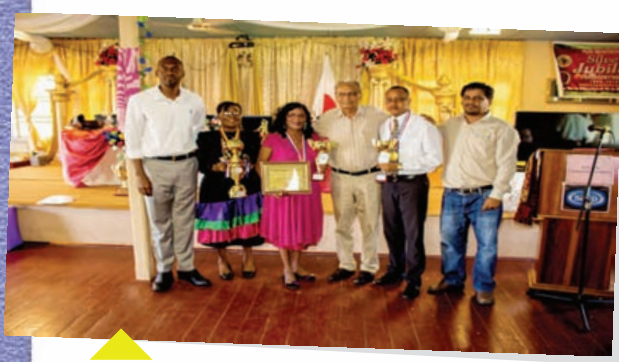
Three outstanding Berbicians with outstanding careers in the field of Education, Sports and Community Development were awarded with the ANSA McAL Award of Excellence in Guyana