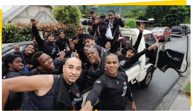
Guardian Media Ltd Participated in Hardcore Caribbean