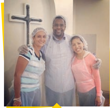
Employees of the ANSA McAL (US) Inc volunteered their time to serve dinner to the residents of the Camillus House, South Florida