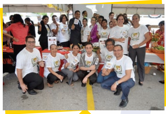
Tatil and Tatil Life continued the chow legacy and hosted its 3rd Chow Mania competition for employees of ANSA McAL's Head Office and ANSA McAL's Financial Services Sector