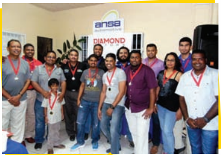
ANSA Automotive supports Cricket Excellence