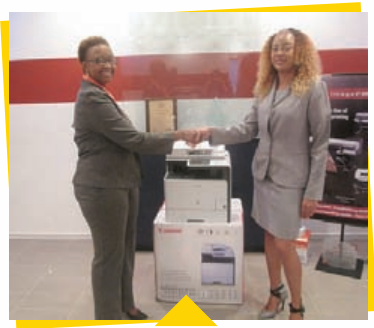
ANSA McAL, through its subsidiary MBM, donated a Canon photocopying/printing machine to the St. Mary's Children's Home A.C. School to help with their day to day operations