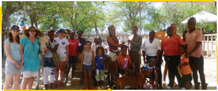
ANSA McAL lent its support, to the Healing with Horses Foundation of Buccoo, Tobago towards their Fifth Annual Summer Camp at the Buccoo Integrated Facility