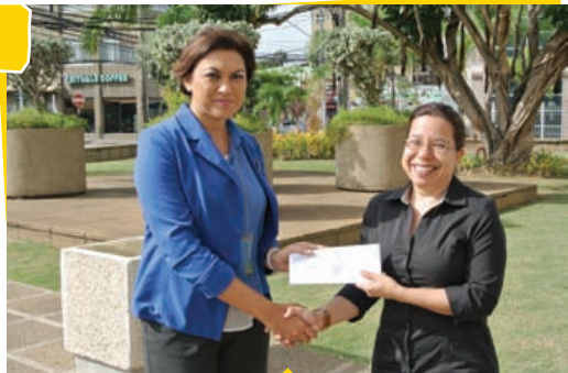
ANSA McAL sponsored the airfare for one member of the Down Syndrome Family Network to participate in a Congress Conference in Phoenix