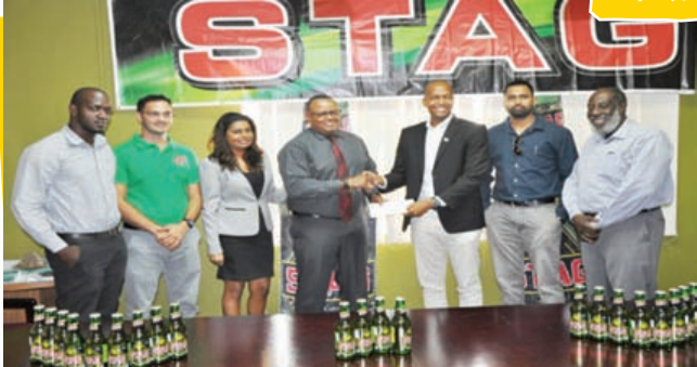
ANSA McAL Trading (Guyana) Ltd, officially partnered with the Guyana Football Federation (GFF) Normalization Committee to stage the inaugural Elite League