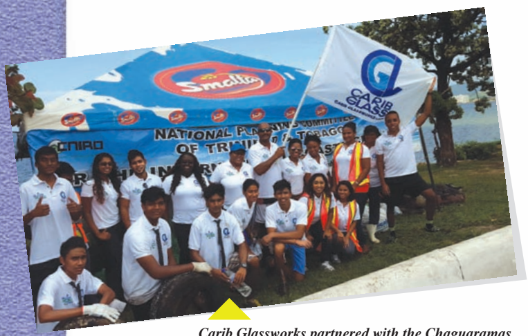
Carib Glassworks partnered with the Chaguaramas Development Authority and the International Coastal Committee for Oceans Conservancy in a massive coastal clean up