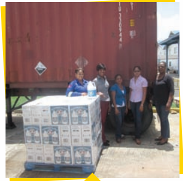
ANSA McAL Chemicals Ltd donated 955 cases of Clean & White Bleach to assist with clean-up efforts in Dominica