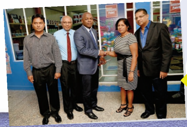
ANSA Coatings launched its Sissons Infinity Colour Shop in the Southern town of Debe