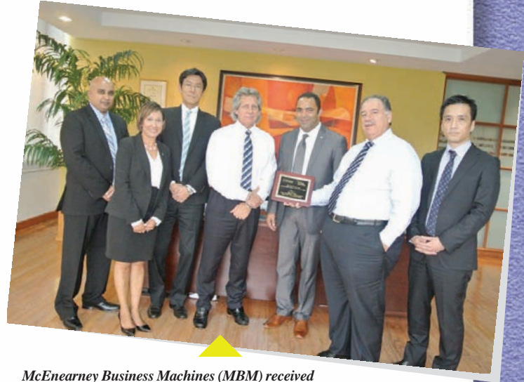
McEneaney Business Machines (MBM) received an Award from Canon for the Most Valuable Partner in the Region. Canon and McEneaney Business Machines have been in partnership since 1968