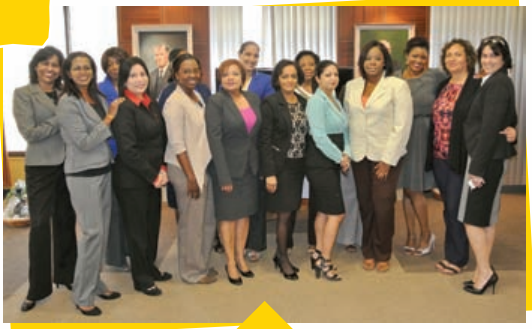
Administrative Professional at ANSA's Head Office were celebrated on Administrative Professionals Day