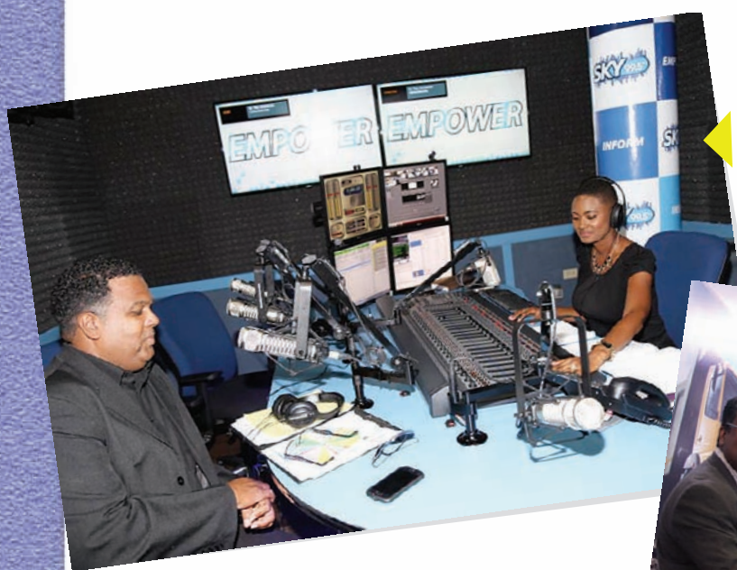
GML's newest radio station Sky 99.5, described as "a breath of fresh air", joined the FM bandwidth