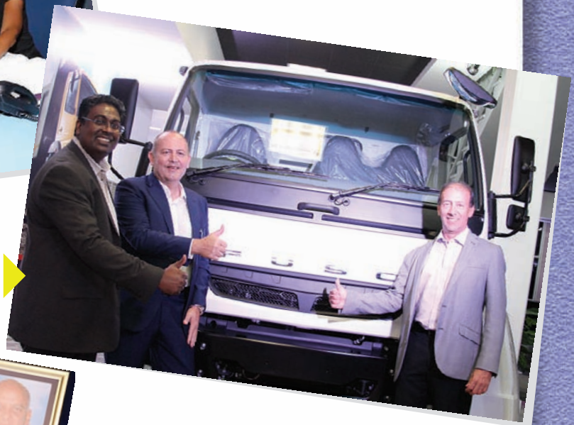
Diamond Motors opened the doors to its newest showroom which houses its FUSO brand of trucks and buses