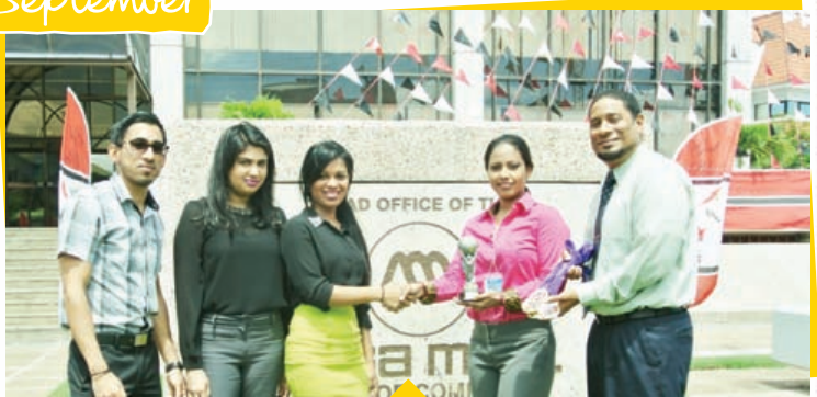
Helping Hands Alliance received sponsorship from the Group towards their Annual Charity Football Tournament