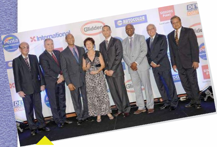
ANSA Coatings Ltd hosted its 3rd Annual Awards Ceremony where awards were given to the top performance in the company's different divisions: Penta, Sissons, Glidden and Automotive Refinish