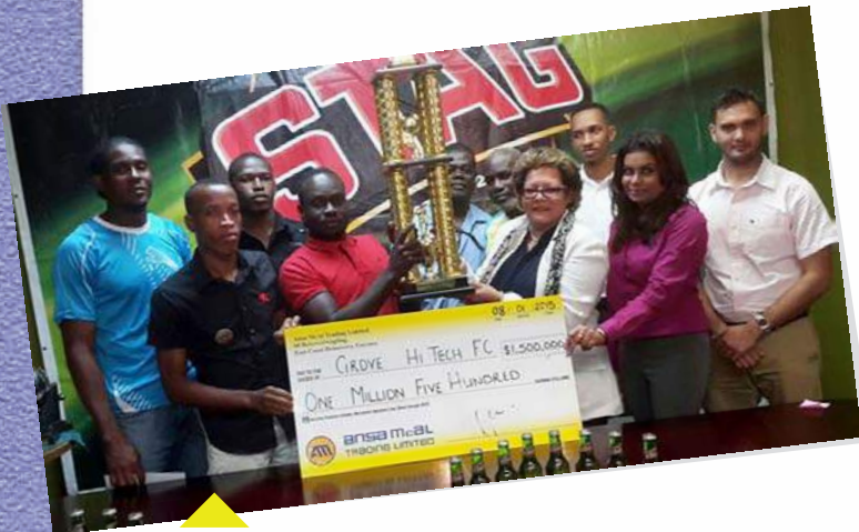
ANSA McAL Trading Ltd (Guyana) was the featured sponsor of the Stag Beer Super 16 Football Tournament. GYD $1.5m was presented to the winners – Grove Hi - Tech.