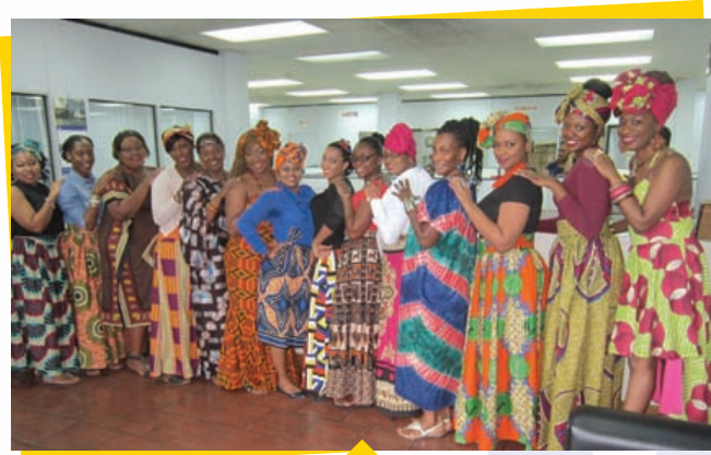
Alstons Shipping celebrated Emancipation Day