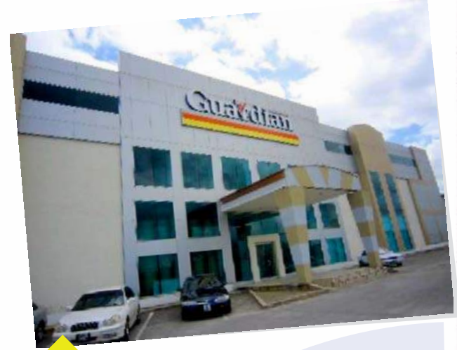
GML relocated to a state-of-the-art facility on AMCO compound, Chaguanas