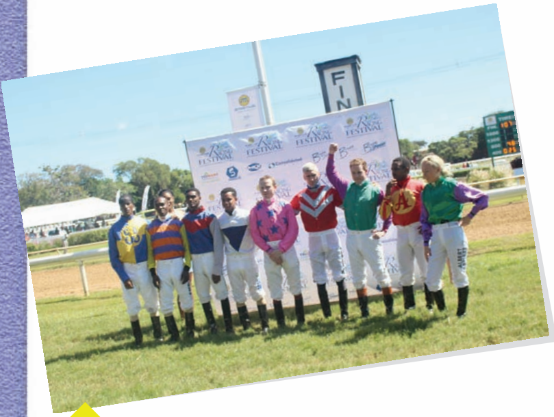
Under beautiful Bajan sunshine ANSA McAL (Barbados) hosted its inaugural race day at Garrison Savannah, Barbados