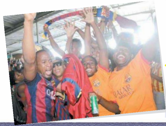
Football fans showed support at the UEFA Champions League, viewing party at the Queen's Park Savannah, sponsored by Heineken