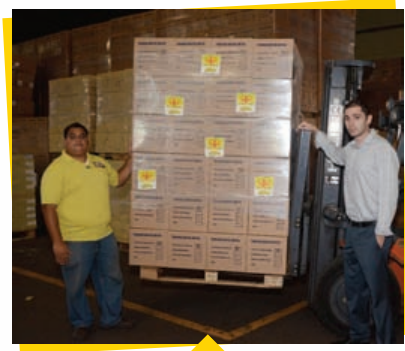
Trinidad Match Ltd, a subsidiary of the ANSA McAL Group of Companies continued its drive in assisting the people of Dominica affected by Tropical Storm Erika, as it donated approximately 5,000 boxes to various households