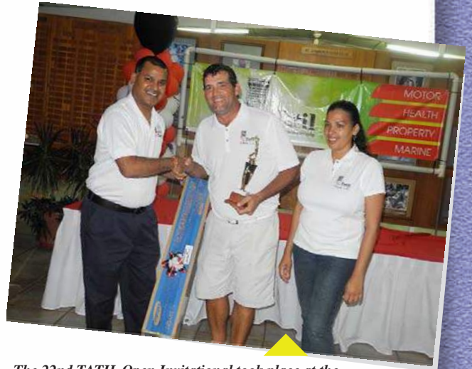
The 22nd TATIL Open Invitational took place at the St. Andrews Golf Club with over 100 participants vying for top prizes in their divisions