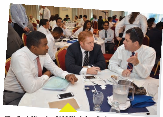
The final Slingshot 2015 Workshop Series concluded with sixteen teams participating in rounds of projects