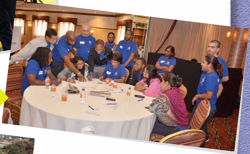
Group HR hosted #7 HR Orientation with over 160 new employees