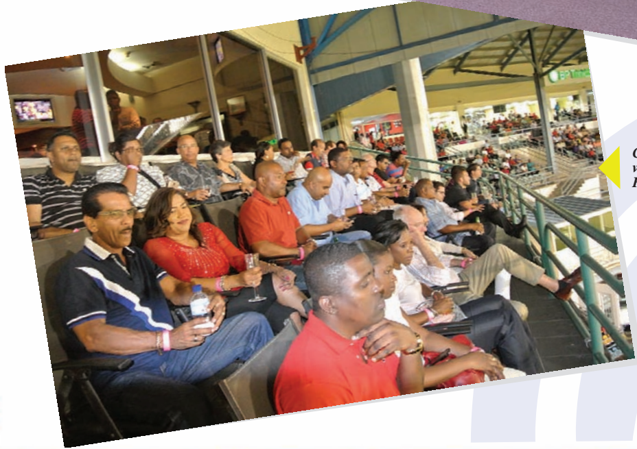
CPL T20 2015 attracted a large viewing crowd at the ANSA McAL Hospitality Booth