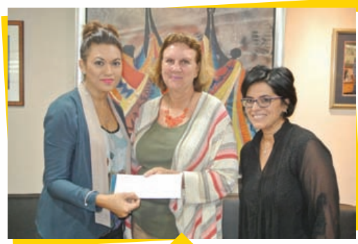
ANSA McAL assisted the Children's Ark in its efforts to raise funds towards the launch of its upcoming project "Awareness and Prevention" of child trafficking for the sex and drug trade in Trinidad and Tobago