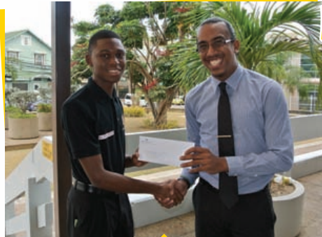
ANSA McAL assisted Queen's Royal College Cadets with the purchase of essential training gear in an effort to provide a more all-round positive cadet experience