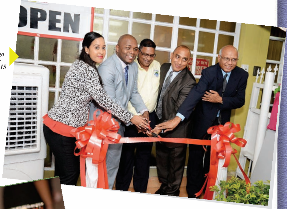
Carib Brewery Ltd, launched Carib Radler, a refreshing beverage that contains two percent alcohol and is a blend of Carib beer and fresh lemon juice