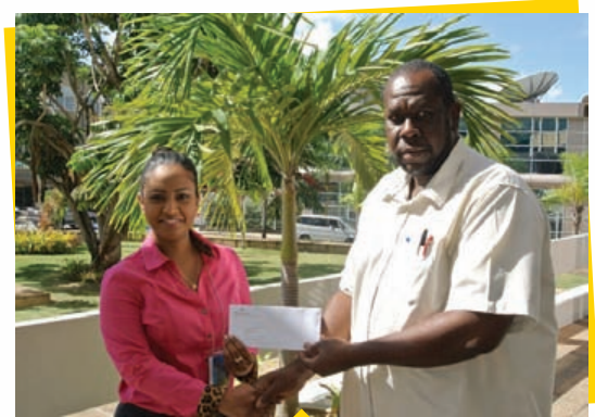
ANSA McAL supported the Chinapoo Police Youth Club, Back to School Programme for under privileged children