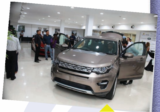
The 2015 Land Rover Discovery Sport is unveiled at Trafalgar Motors