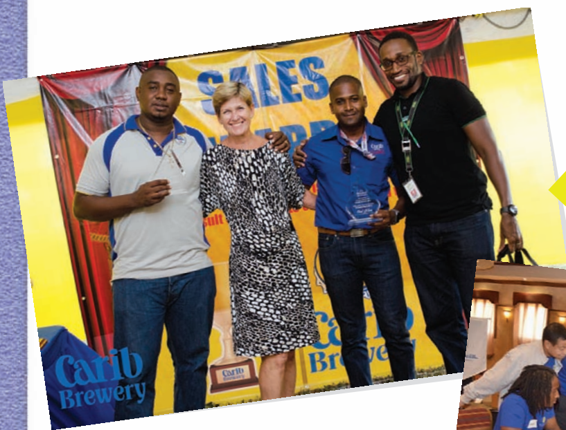
Carib Brewery rewarded their hard-working sales team for outstanding performances in 2014