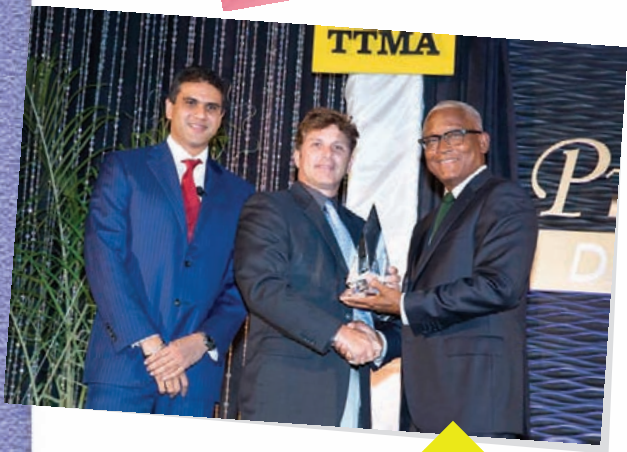
ABEL Building Solutions was named Manufacturer of the Year (Large) at Trinidad and Tobago Manufacturer's Association (TTMA) Awards