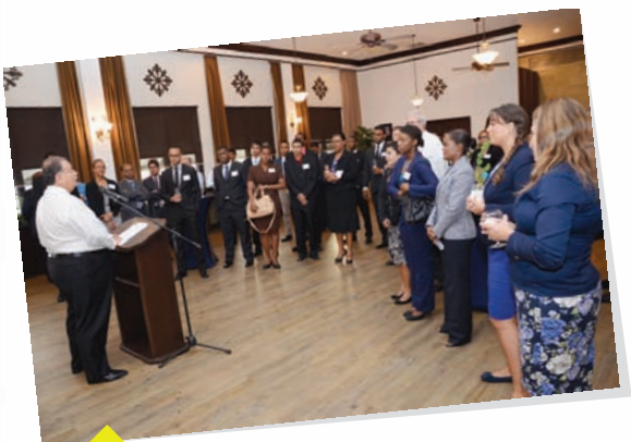
Candidates from the ANSA McAL Champions Development Programme were hosted by the Group Chairman at a Champions Development Mixer held at Jaffa at the Oval