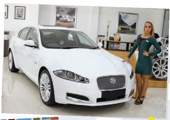
Trafalgar Motors displayed their signature vehicles Range Rover Evoque, Land Rover Discover, Range Rover Sport and the Jaguar XF to potential customers