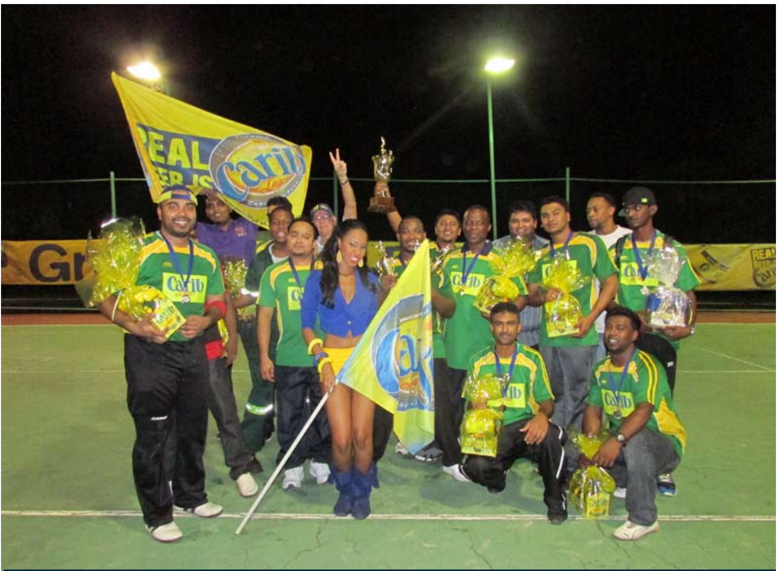
Carib Glassworks Limited's Champion A-Team