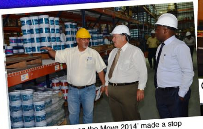
'Chairman on the Move 2014' made a stop at ANSA Coatings Ltd.