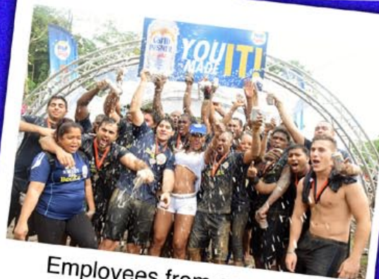
Employees from across the Group took part in the HARDCORE Challenge

C O R P O R A T E B R O A D C A S T D E C E M B E R 2 0 1 4