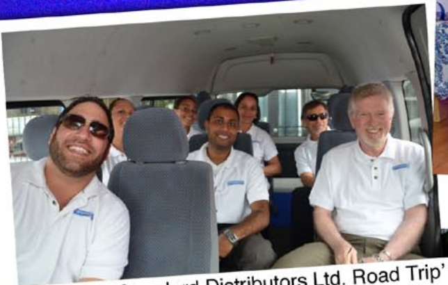
The first 'Standard Distributors Ltd. Road Trip'