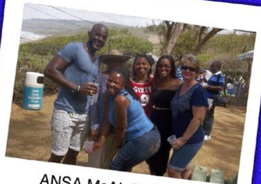
ANSA McAL Barbados' Staff Picnic & Lime