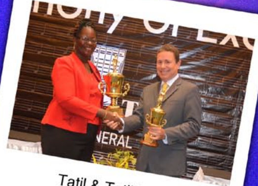
Tatil & Tatil Life's 2012/2013 Agents' Awards