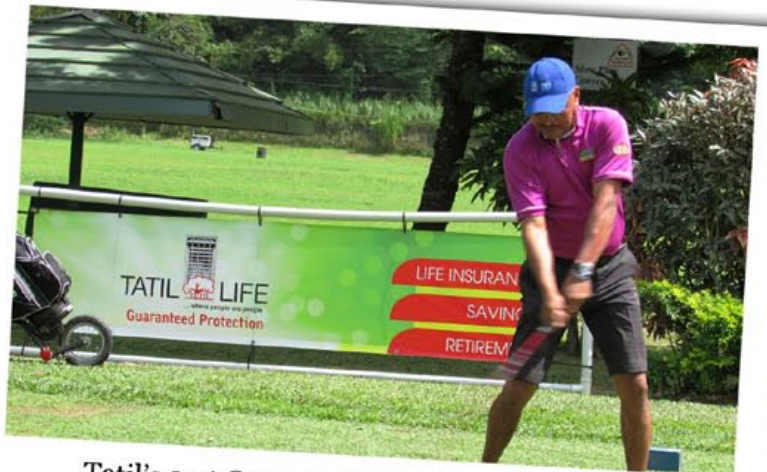
Tatil's 21st Open Invitational Golf Tournament