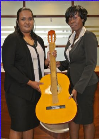
ANSA McAL supported the Nazareth United Holy Church's initiative to provide music lessons for the young people in their community