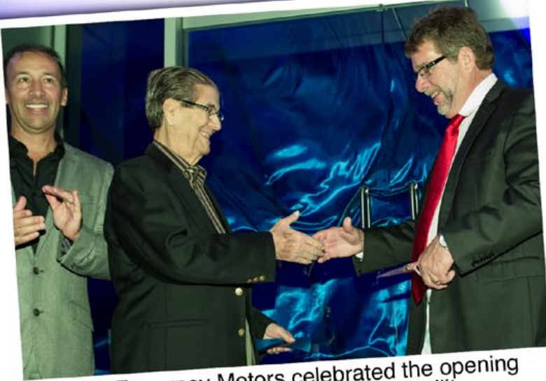
McEneaney Motors celebrated the opening of its state-of-the-art Ford Facility