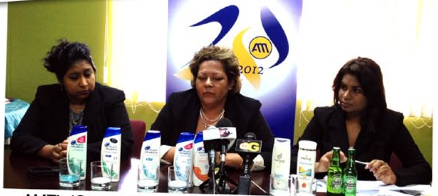
AMTL (Guyana) took a stand against counterfeit products on their local market