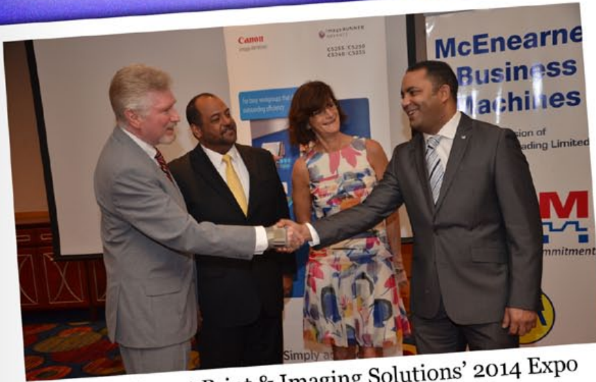
MBM's 'Smart Print & Imaging Solutions' 2014 Expo