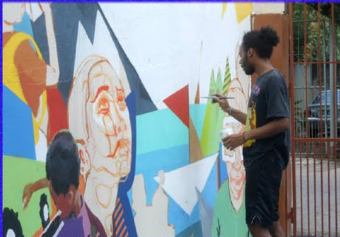
Penta Paints contributed towards the repainting of the Richmond Street Boys' School