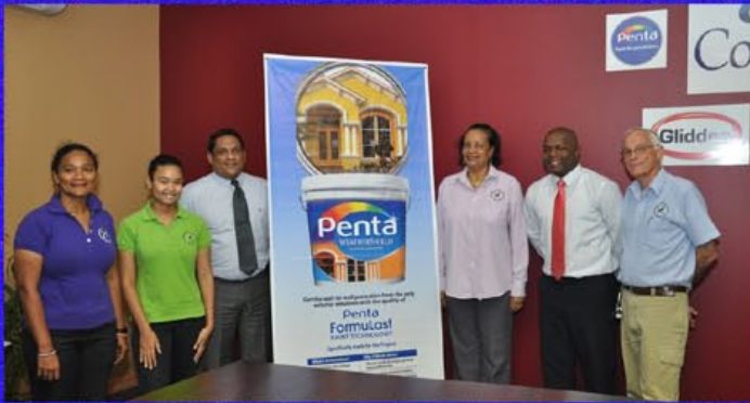
ANSA Coatings Limited signed a partnership agreement with the Asa Wright Nature Centre to be the sole provider of paints for the nature resort