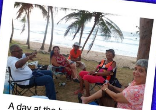
A day at the beach with Brydens Insurance, Barbados