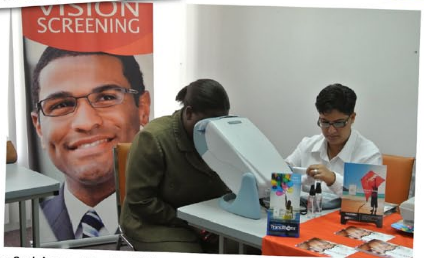
The 2nd Annual Health & Wellness Week was hosted in the Tatil Building