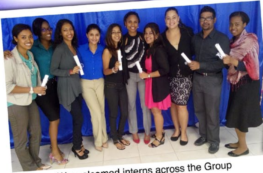
We welcomed interns across the Group