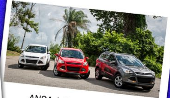
ANSA Automotive introduced us to the Ford Kuga