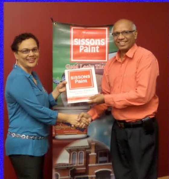
Sissons Paints donated fifteen gallons of paint for refurbishment of The Immortelle Centre