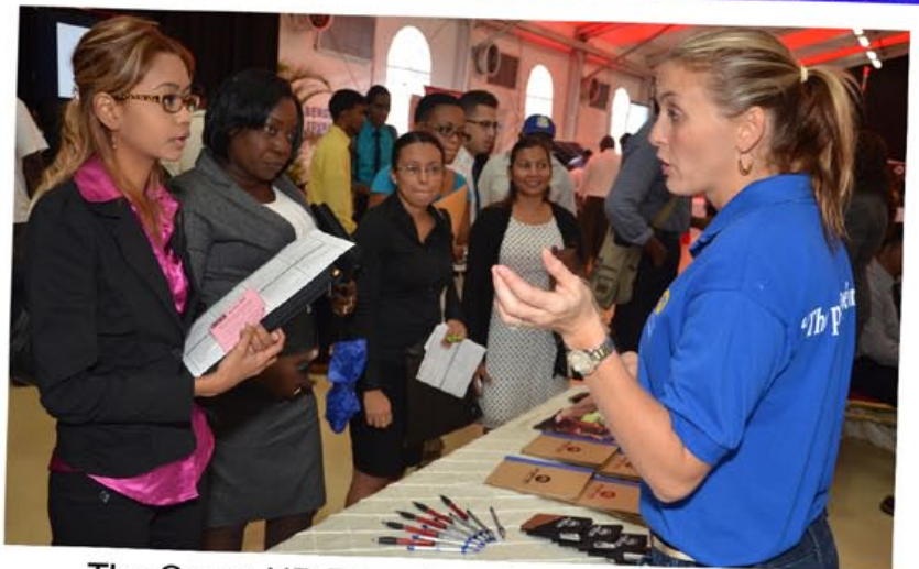
The Group HR Department participated in the University of Trinidad and Tobago's 2014 Job Fair