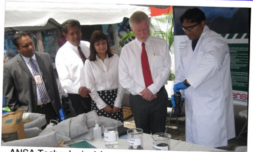
ANSA Technologies' Annual Health & Safety Expo 2014