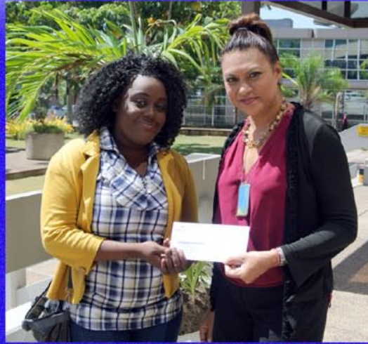
ANSA McAL assisted the John Roberts Memorial School, Tobago with the hosting of their Sports and Family Day