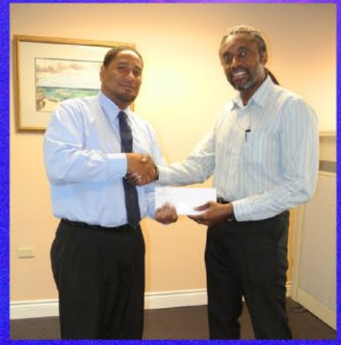
ANSA McAL was a sponsor of the Down Syndrome Family Network's Annual Conference