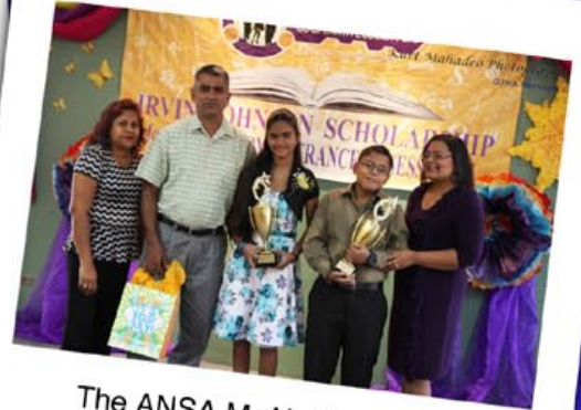
The ANSA McAL Credit Union congratulated their junior members for their success in the SEA exam