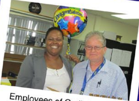
Employees of Carib Brewery graduated from the Harvard ManageMentor Programme