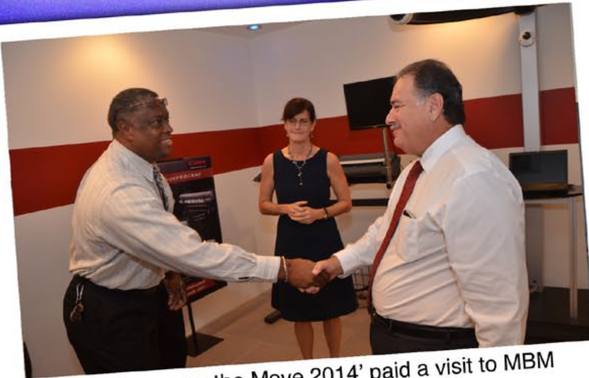
'Chairman on the Move 2014' paid a visit to MBM