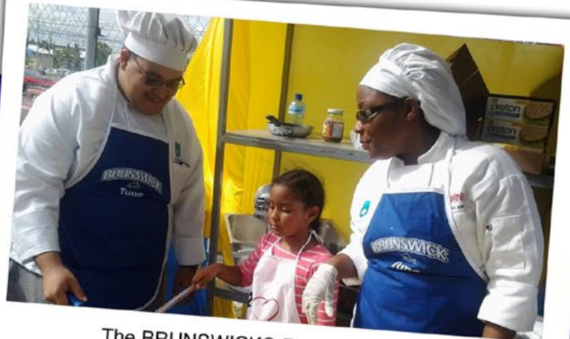
The BRUNSWICK® Food Fair hit the road