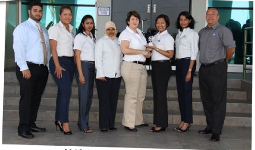
AMCO won a regional award