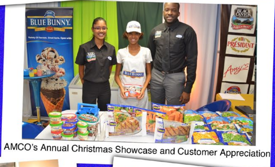
AMCO's Annual Christmas Showcase and Customer Appreciation