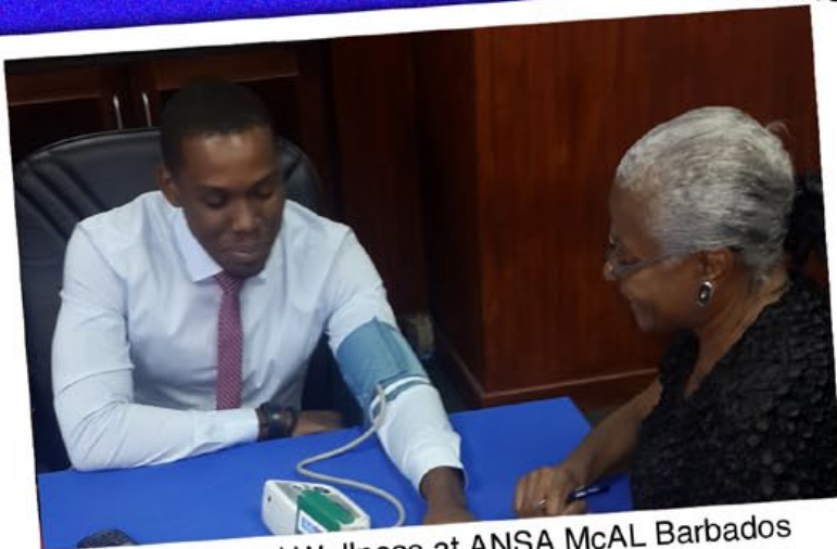
Health and Wellness at ANSA McAL Barbados