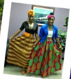
Employees from Alstons Shipping celebrated Emancipation Day