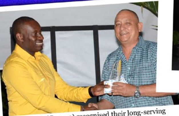
AMTL (Guyana) recognised their long-serving staff and outstanding employees