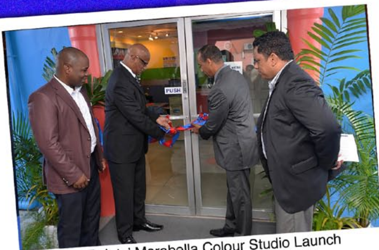
Penta Paints' Marabella Colour Studio Launch