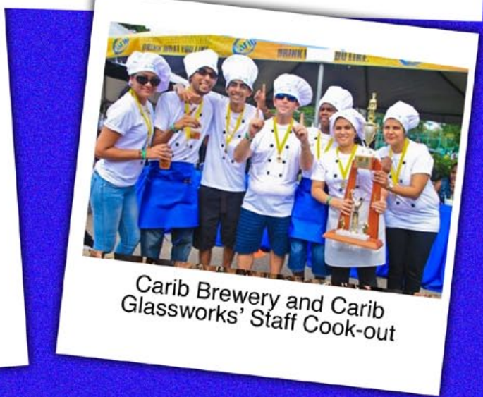
Carib Brewery and Carib Glassworks' Staff Cook-out