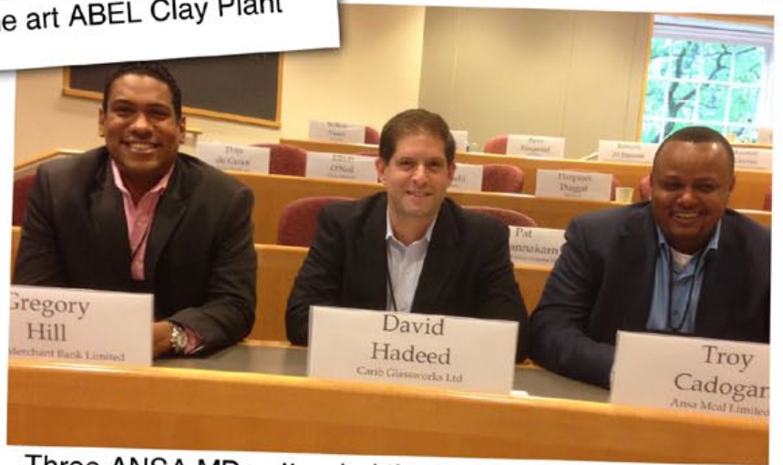
Three ANSA MDs attended the Harvard Business School