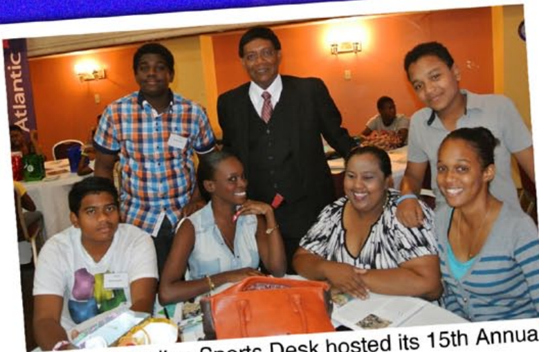
The Guardian Sports Desk hosted its 15th Annual Youth Symposium

C O R P O R A T E B R O A D C A S T D E C E M B E R 2 0 1 4