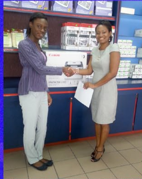
A Canon fax machine was presented to community based NGO PAVI (Persons Associated with Visual Impairment)