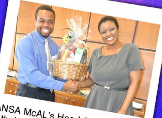
ANSA McAL's Head Office honoured their Administrative Professionals