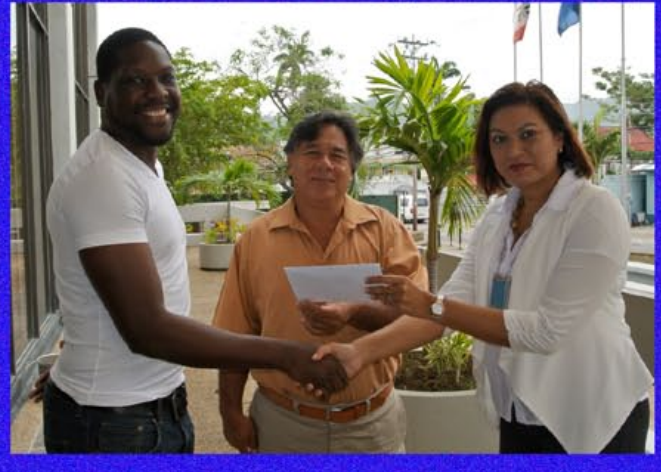
ANSA McAL gave a financial contribution to the Trinidad and Tobago Schools Rugby Football Union for their team's tour of Canada