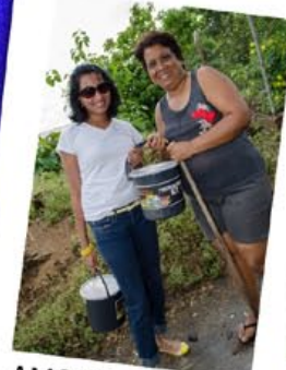
AMCO introduced its 2014 Disaster Preparedness Campaign