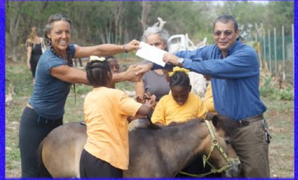
ANSA McAL assisted The Healing with Horses Foundation of Buccoo, Tobago with the hosting of their Fourth Annual Summer Camp