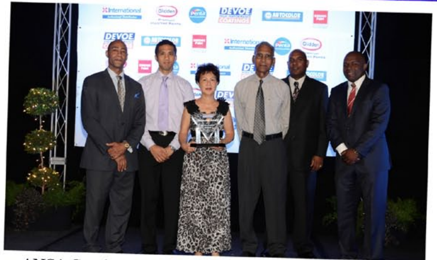
ANSA Coatings Limited honoured its top customers