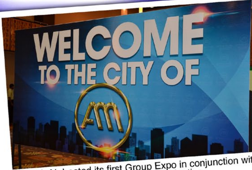
ANSA McAL hosted its first Group Expo in conjunction with its 85th Annual General Meeting