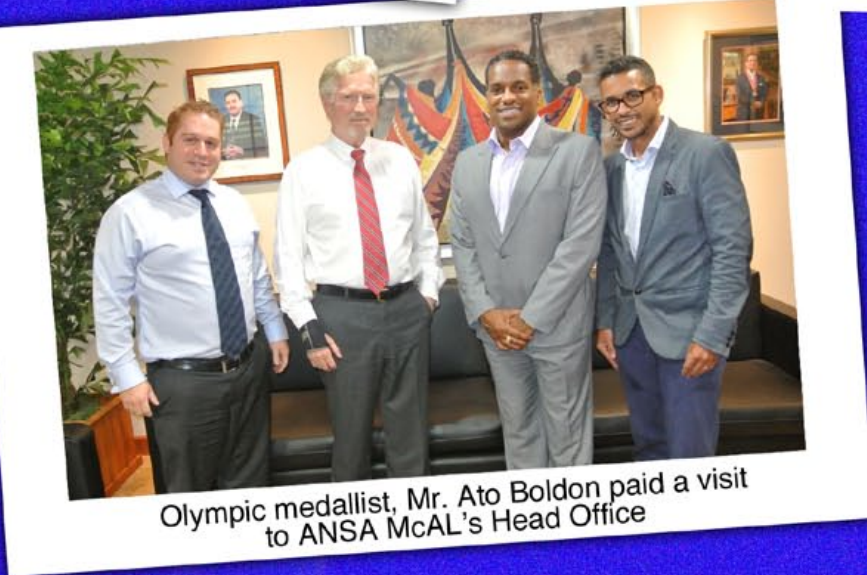
Olympic medallist, Mr. Ato Boldon paid a visit to ANSA McAL's Head Office