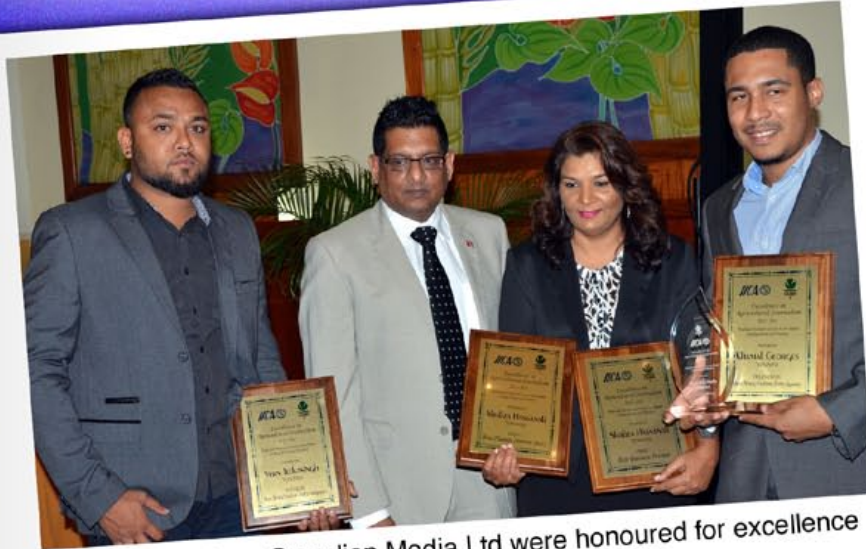
Journalists from Guardian Media Ltd were honoured for excellence