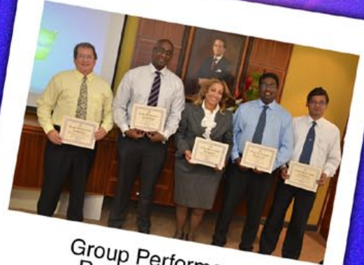
Group Performance Recognition 2013