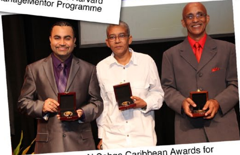
Anthony N Sabga Caribbean Awards for Excellence 2014 Laureates