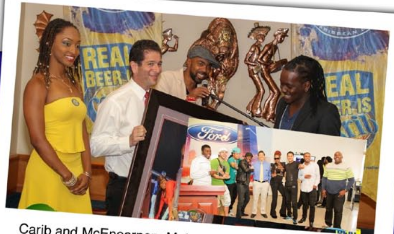
Carib and McEearnery Motors partnered for Carnival 2014

C O R P O R A T E B R O A D C A S T D E C E M B E R 2 0 1 4