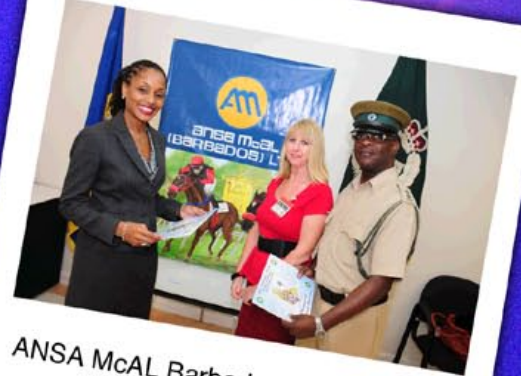
ANSA McAL Barbados partnered with local rehabilitation programme