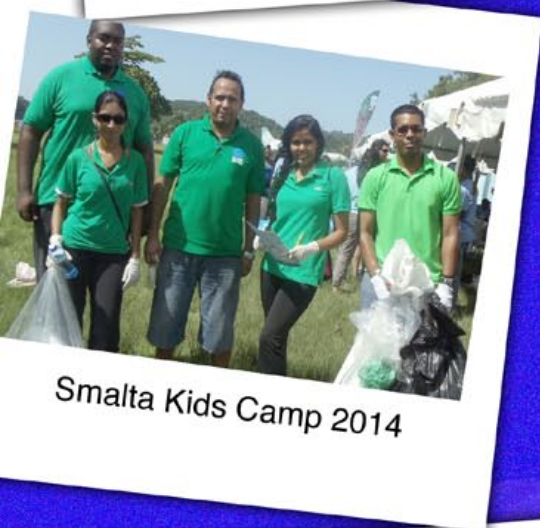
Smalta Kids Camp 2014