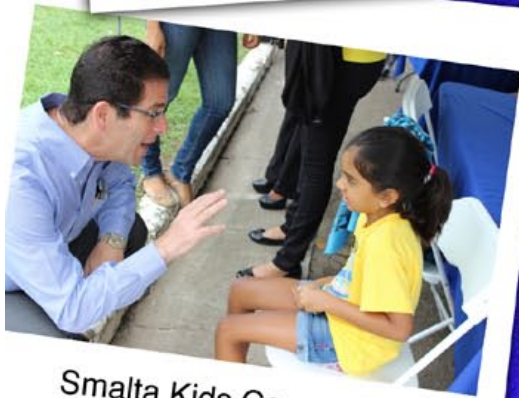
Smalta Kids Camp 2014