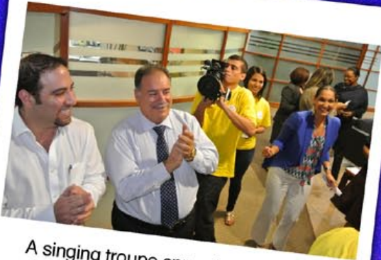
A singing troupe spread smiles in the Tatil Building on World Happiness Day