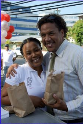
ANSA McAL subsidiaries participated in the ReThink Organisation's World Happiness Day activities