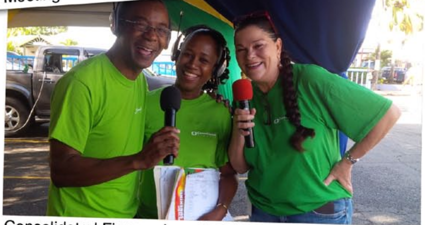
Consolidated Finance launched its Green Finance Package