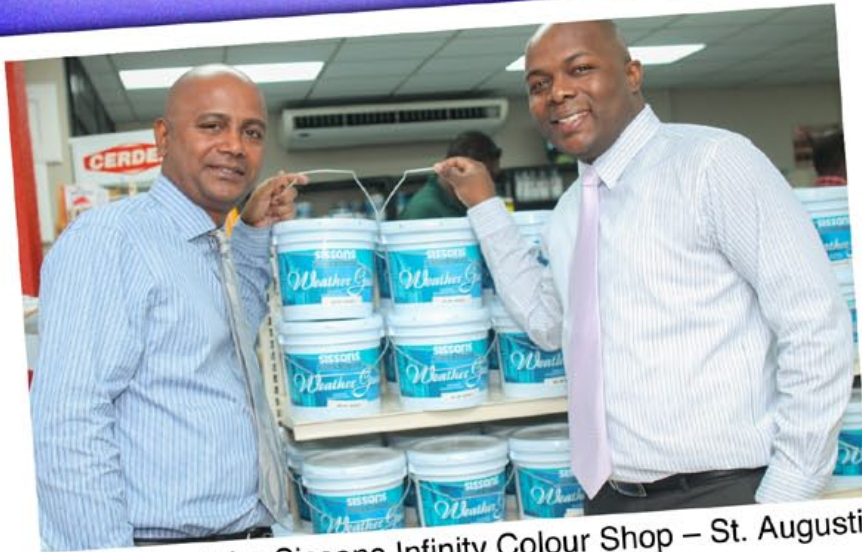
Re-launch of the Sissons Infinity Colour Shop – St. Augustine