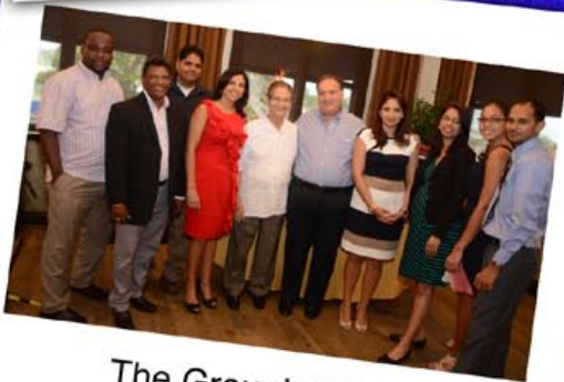
The Group's 2013 Sector Performers were honoured for their achievements