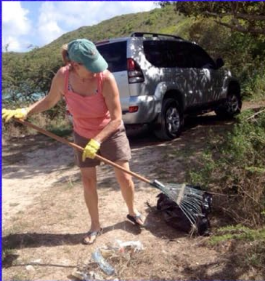
Carib Brewery (St. Kitts & Nevis) sponsored a beach clean-up