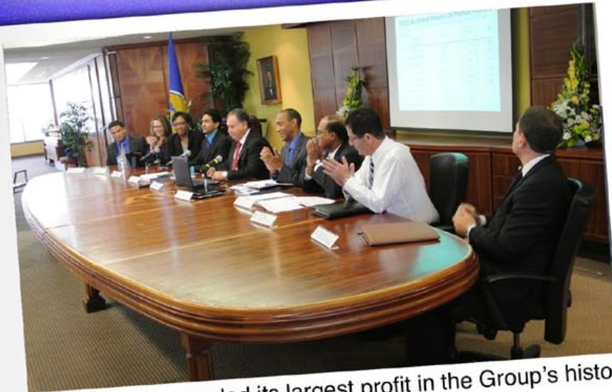
ANSA McAL recorded its largest profit in the Group's history