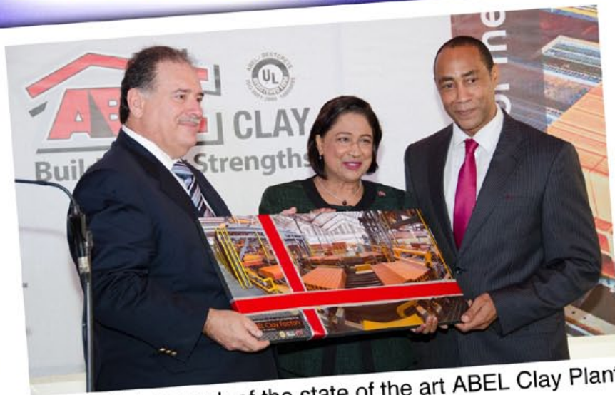
The official launch of the state of the art ABEL Clay Plant