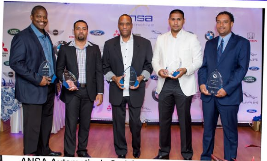
ANSA Automotive's 2nd Annual Awards Ceremony