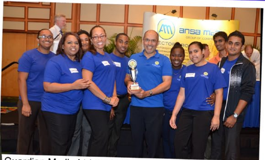
Guardian Media Ltd. took the crown at our HR Orientation