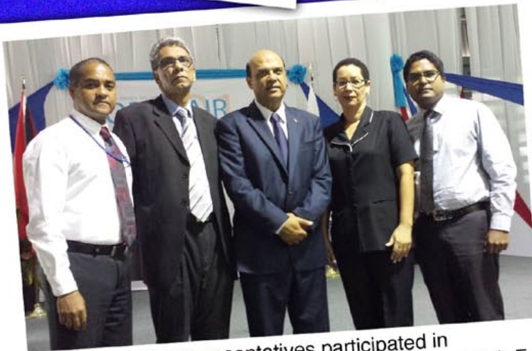
HR representatives participated in the National Energy Skills Center's First Annual Job Fair