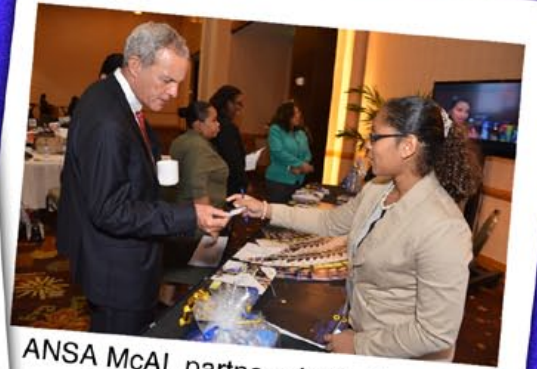
ANSA McAL partnered with the Institute of Chartered Accountants of Trinidad and Tobago as a Platinum Sponsor