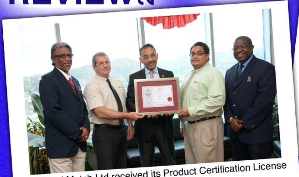
Trinidad Match Ltd received its Product Certification License