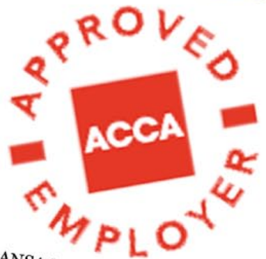
The ANSA McAL Group of Companies was re-certified as an 'Approved Employer'