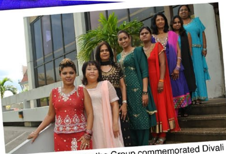
Employees across the Group commemorated Divali